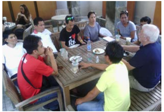
Business meeting at Starbucks

I am planning to take my wife and two other couples back in February