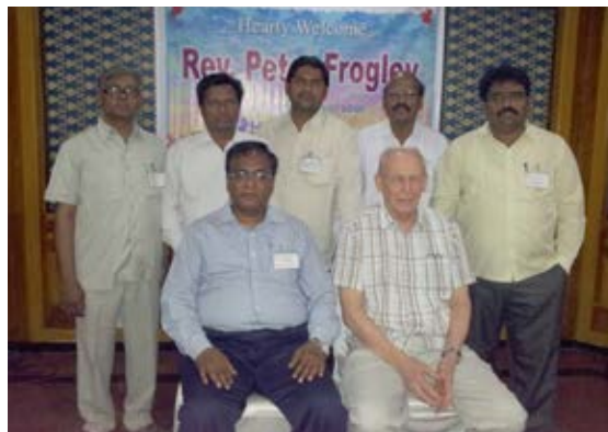
BMi India National Leadership Team

I left Rajahmundry with a sense of well-being for the churches and with pastors in good heart and positive expectation for their future.